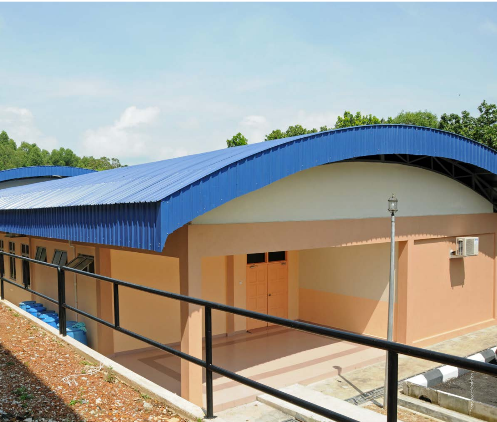
Good example of a closed up hatchery to reduce the risk of introducing pathogens.

For fish hatcheries, biosecurity consists of various, simple, sometimes zero-cost measures that will keep pathogens away from fish and keep fish away from pathogens . The principles of biosecurity can be applied in both large-scale animal production units and backyard or small-scale animal production units. These principles may, however, be difficult to follow in aquatic environments compared to terrestrial, and different measures of biosecurity may have to be applied in different circumstances.