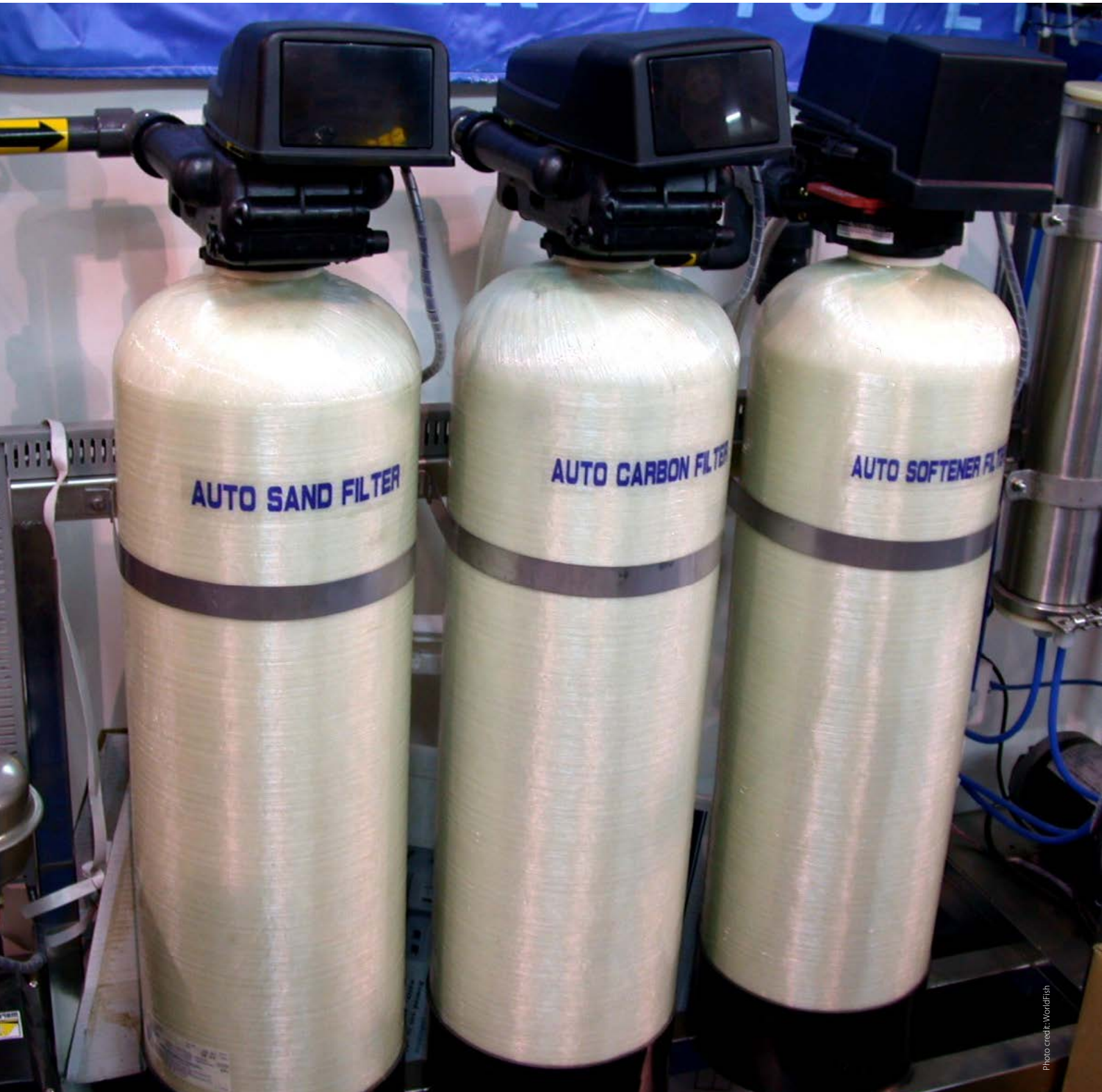
Various models can be used to filter water supply to the hatchery.

before use. If water is obtained from an open source, it should be treated using a sand filter, UV light or ozone before use. Avoid splashes and aerosols between tanks since these can spread pathogens. If water is contaminated with arsenic or other heavy metals, it should be treated before use.