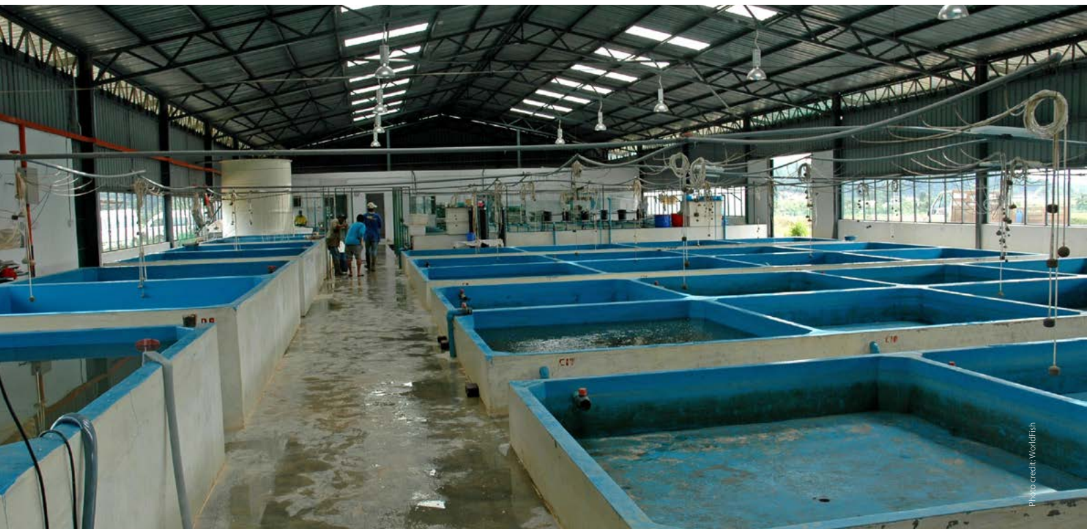
A well-lit hatchery is essential to do the work efficiently at any hour of the day.

After an outbreak, even doing a thorough cleanup of the hatchery will not guarantee that the fry/fingerlings produced are free of the disease. They may continue to carry pathogens, especially if it is a disease caused by viral infections like TiLV. Implementing biosecurity is about adopting good management practices, which cost less than treating diseases. Implementing biosecurity assures a successful project.