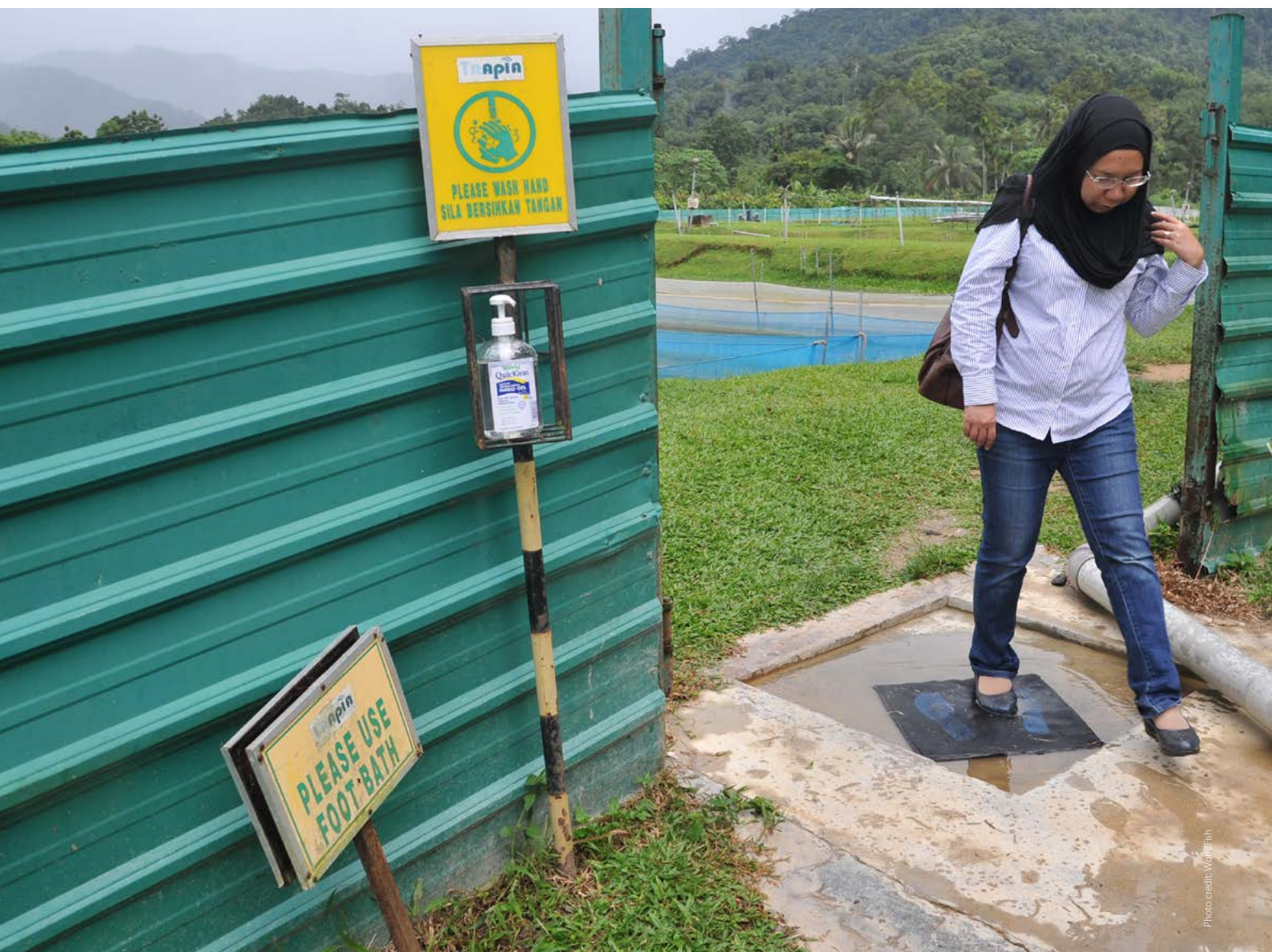
Signboard on sanitation and disinfection procedure at entrance of the farm.