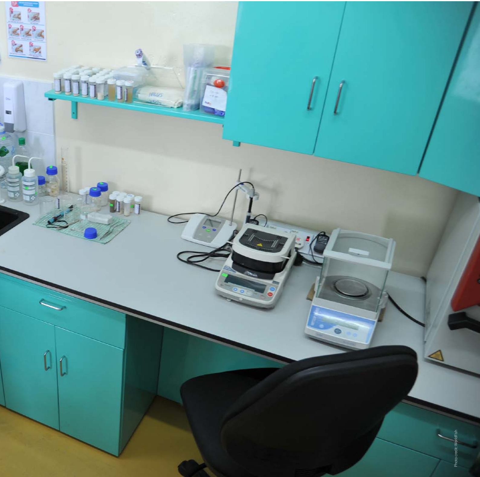
A small lab for testing water quality and simple examinations of fish smears.

measurements of the water quality, including temperature, dissolved oxygen levels, pH and ammonia and nitrite levels. The instruments should be calibrated to ensure reliable readings. If the readings are not within the acceptable ranges, appropriate measures must be taken to correct the situation because changes to water quality can stress the fish.