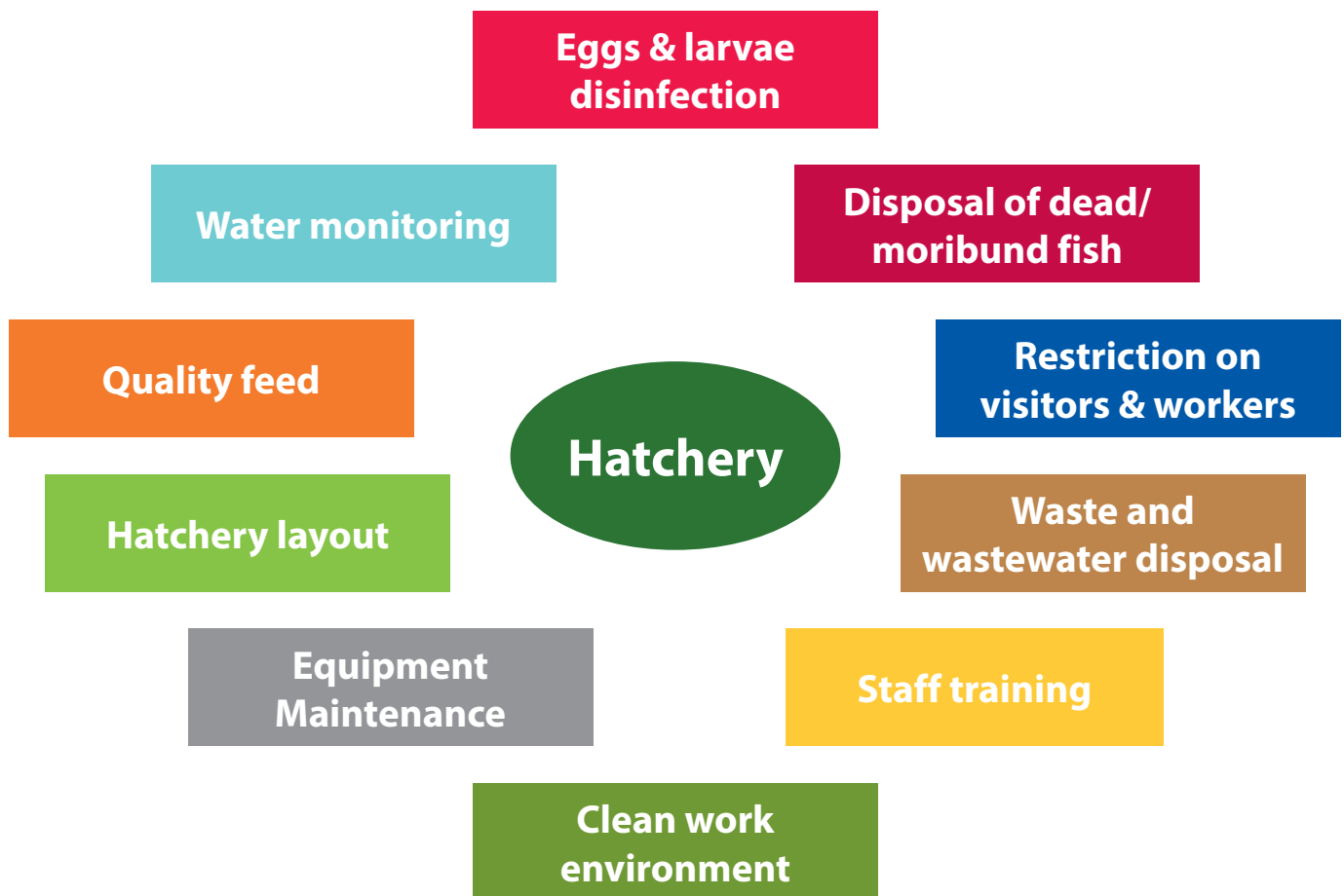
Figure 1. Biosecurity measures for hatcheries.

not introduced from outside the hatchery and subsequently spread within it by contamination, resulting in fish dying.