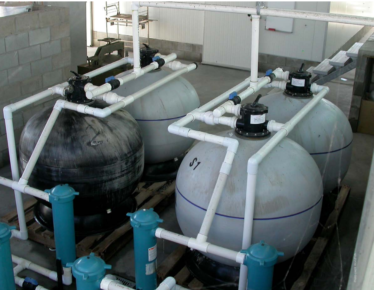
Sand filters and UV light used for treating the water supply to the hatchery.