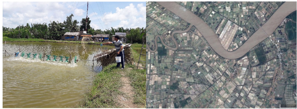
Fig. 1 Left: Shrimp farmer applying feed in a semi-intensive shrimp production system. Right: Google earth view of the My Thanh River mouth in Soc Trang province, Mekong Delta (Vietnam), in August 2015, illustrating the concentration of shrimp ponds in the landscape

(Struik et al. 2014). Similar to the agricultural sector, aquaculture production systems and value chains, especially for shrimp as an export commodity, are strongly influenced by food safety regulations and product quality, with the development of quality standards. Therefore, even if farms are central to the innovation process, an analysis of the constraints to innovation requires a framework that not only encompasses economic or technical dimensions, but also integrates biophysical, institutional, and market structure dimensions. Innovation is thus the outcome of a multi-stakeholder process of actors linked to those dimensions, involving different value chain actors and their broader regulatory and support environment, which then jointly form an aquaculture innovation system (Doloreux et al. 2009; Joffre et al. 2017).