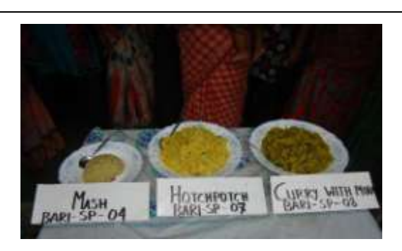
Curry with Mola fish demonstration