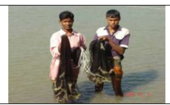
Shrimp harvested by farmer to sell at local market