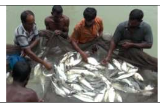
Commercial fish farming