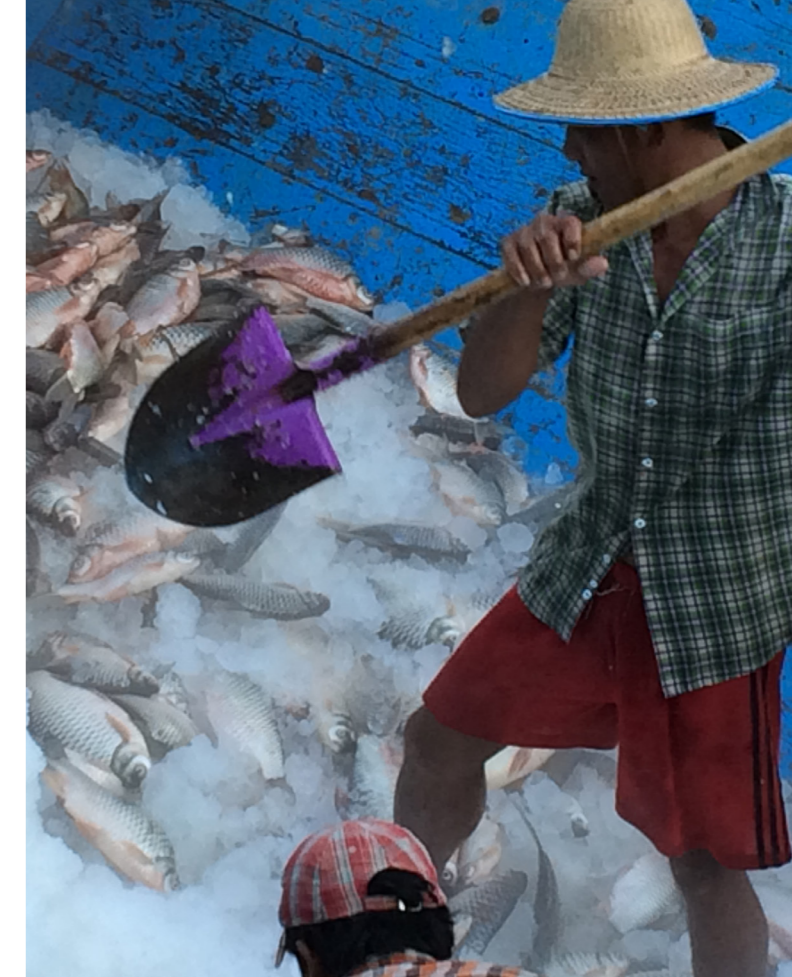
Workers packing harvested fish in ice for delivery to market.

Aquaculture has tremendous scope for future expansion in Myanmar. Regulatory reforms would create a level playing field for producers of all sizes, acting as an engine for more inclusive growth by raising incomes for small farmers and creating employment in SMEs in the supply chain. Better access to inputs, including credit, and new productive technologies would improve the profitability and diversity of farming systems and non-farm enterprises, create new export market opportunities and make farmed fish more cheaply and widely available to consumers. Building human and institutional capacity can support the sector’s modernization by improving the effectiveness of service provision and governance.