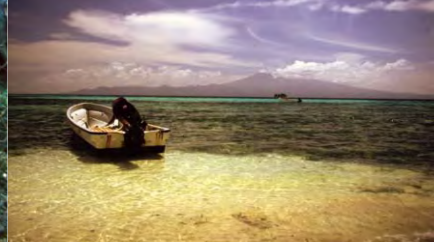
Marine protected areas assist coastal communities to manage their marine resources effectively.