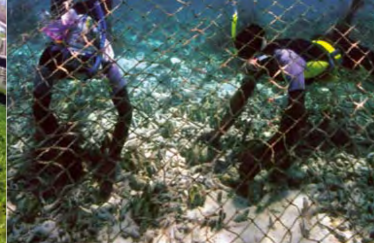
Restocking sea cucumber will help to accelerate the rate of recovery of overfished populations.