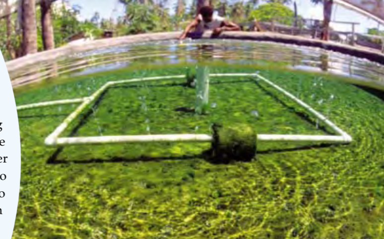
The WorldFish Center is committed to assisting the Pacific islanders to increase the productivity of their coral reef fisheries.

Although restocking can play a vital role in regenerating overfished stocks, it is preferable to prevent fished stocks from becoming depleted in the first place. The Center is addressing the overfishing problem by assisting coastal communities in Solomon Islands to fish their sea cucumber resources in a sustainable way. Together, the fishery management and restocking projects are delivering major benefits to coastal communities that rely on producing bêche-de-mer (processed sea cucumbers) for income. The Center is also helping communities obtain better returns for their bêche-de-mer by adopting processing methods that yield a high-quality dried product for the market.