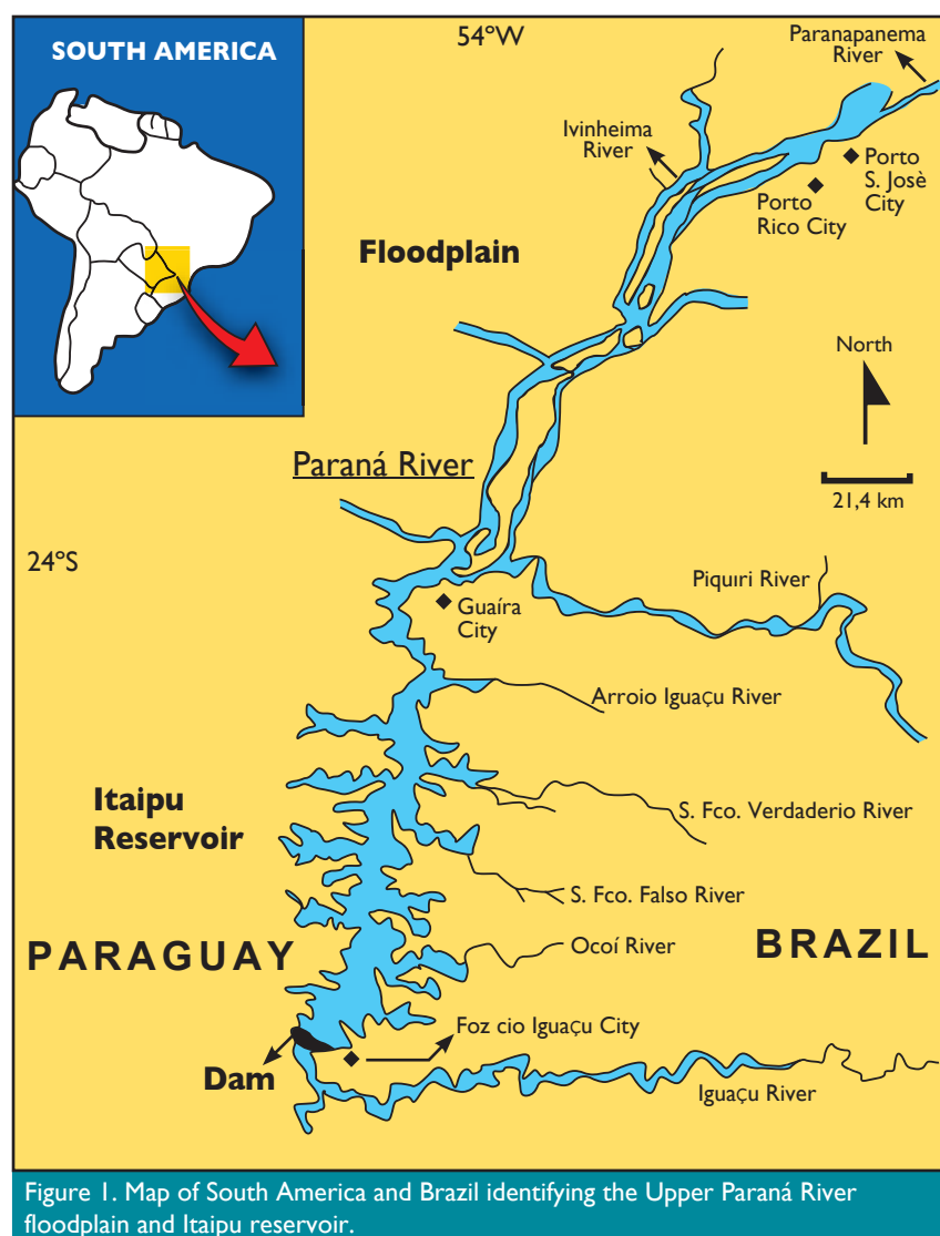
Figure 1. Map of South America and Brazil identifying the Upper Paraná River floodplain and Itaipu reservoir.

In order to infer the population response to impacts from two different ecosystems during two periods, the parameters K, L_{\infty} , M, QB and TL were estimated and compared for the 35 more abundant species from the upper Paraná river floodplain and the Itaipu reservoir.