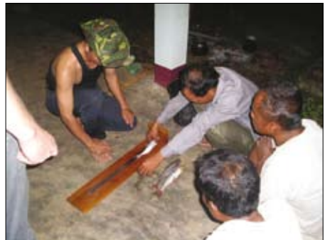
Teaching local fishers from Laos (Mekong River) to take length measurements

As length measurements are easy to take and offer many additional advantages, not least making the quality and validity of collected data easy to check (see Box 2), length is