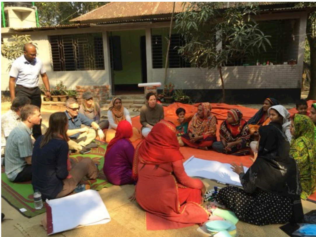
Photograph: Rapid assessment, Dhaka Sub-district