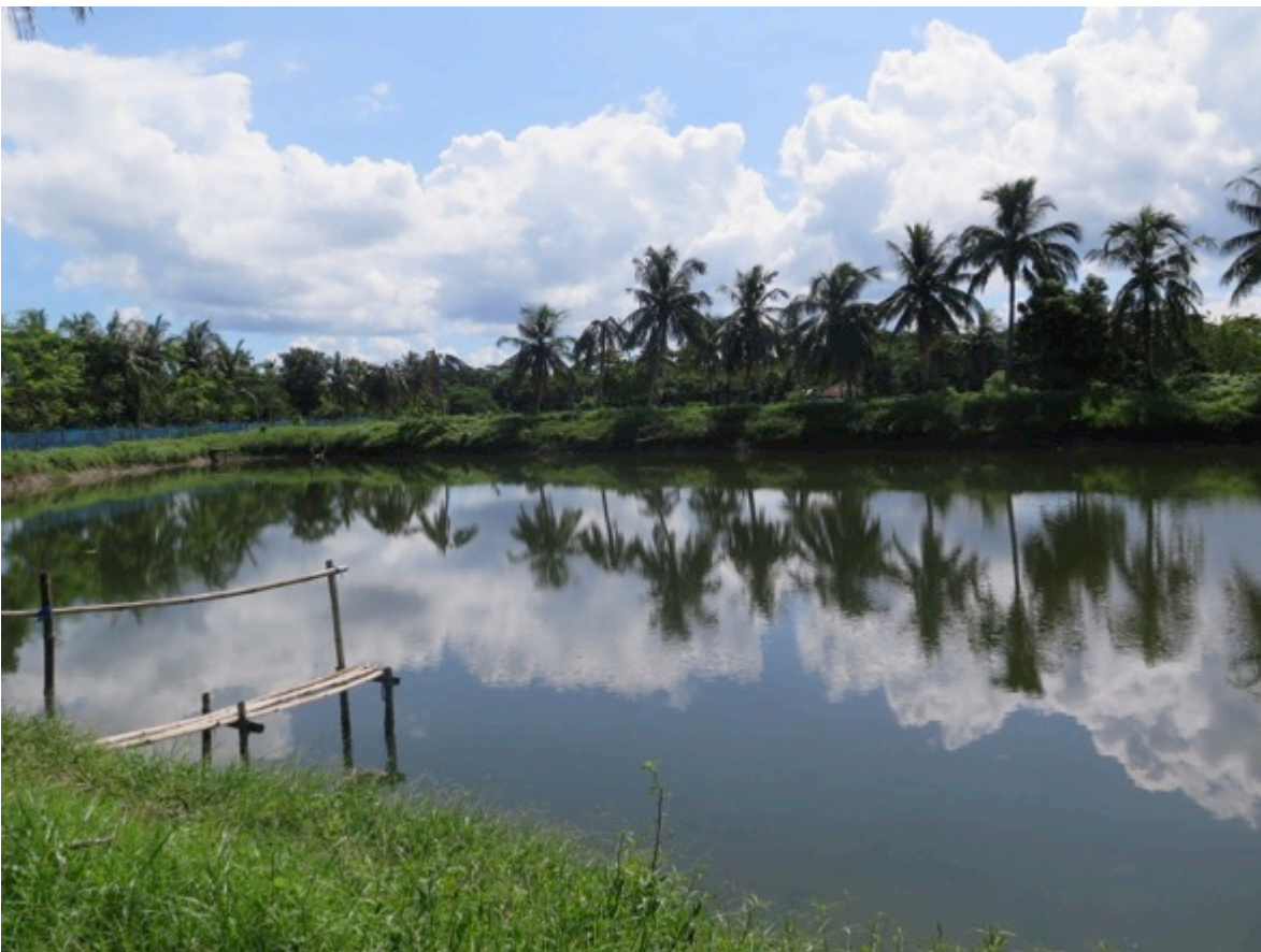
Photograph: Semi-intensive shrimp farm, Katakhalia, SW Bangladesh.