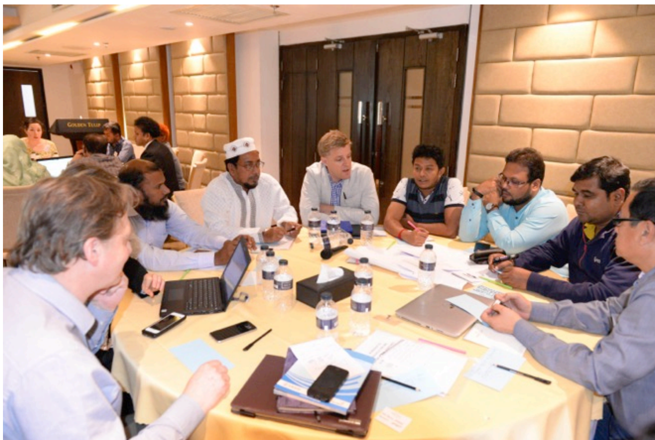
Photograph: Workshop attendees discussing shrimp and AMR.