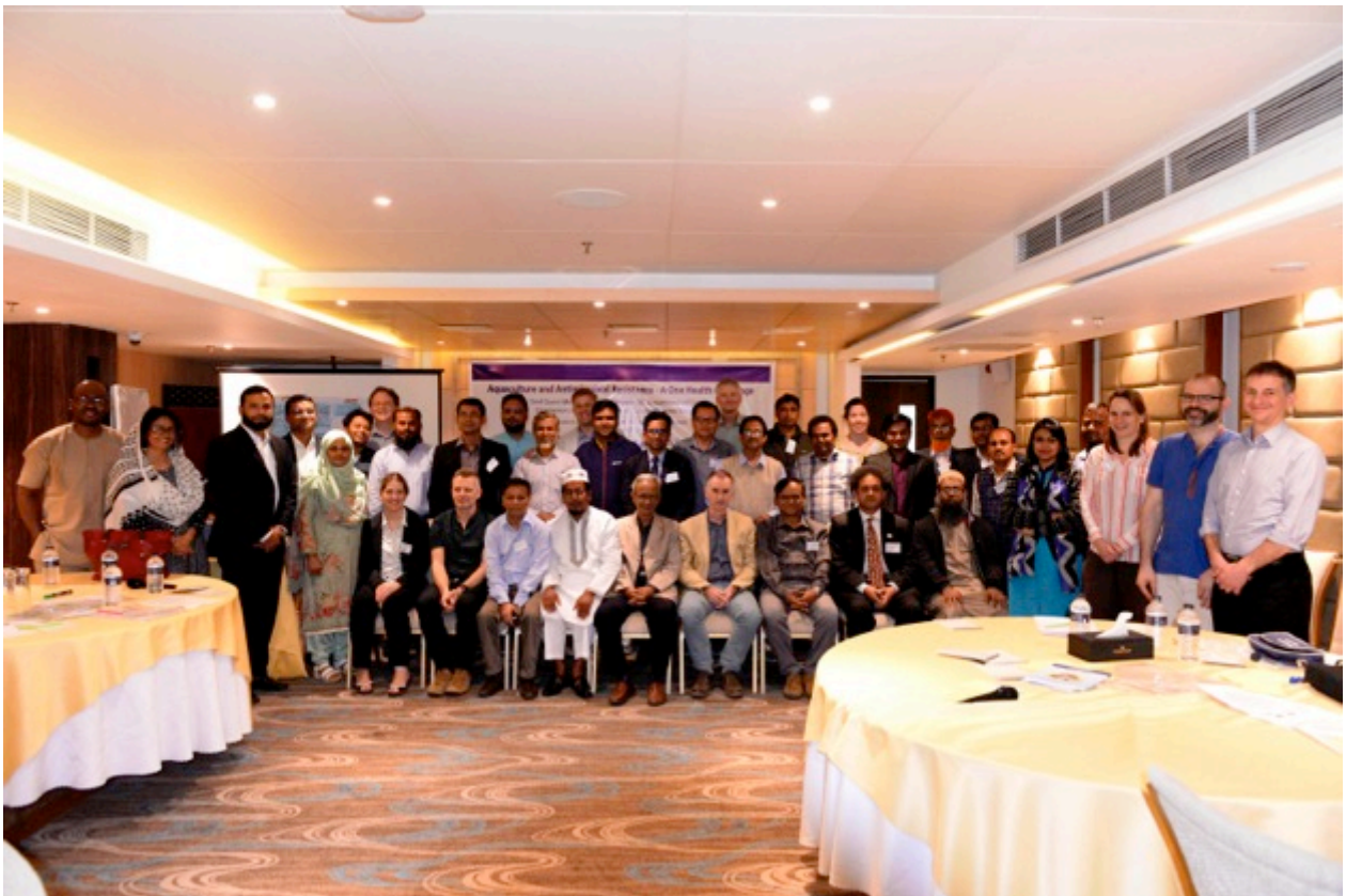
Photograph: Workshop attendees: Dhaka 14/02/19