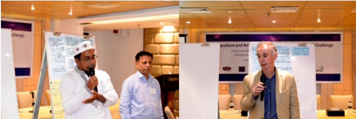
Photographs: Concluding speeches.