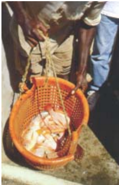
Fig. 3. Red hybrid tilapia cultured in Jamaica.

On larger commercial farms, ponds are usually rectangular with a mean depth of 1.0-1.5 m. Most are equipped with concrete monks for draining. Most of the larger farms maintain their own broodstock of red tilapia hybrids (Fig. 3). Various phenotypes with differing pigmentation patterns are observed on the farms including red/gold-