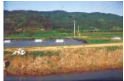
Fig. 4. Typical grow-out ponds with aerators.

Generally, farm-raised tilapia larger than 200 g are well received by consumers and much of the small-