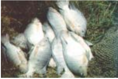
Fig. 1. O. niloticus harvested from a pond in Jamaica.

commercial tilapia culture are provided by Carberry and Hanley (1997). Of the 10 000 km 2 total land area, only approximately 14% is suitable for aquaculture due mainly to the dominance of porous limestone and a relatively limited water supply. Most tilapia farms are located on the south-central plains where clay soils and an extensive system of irrigation canals installed by the sugar cane industry provide the water supply infrastructure (Hanley 2000). The total aquaculture area is estimated at