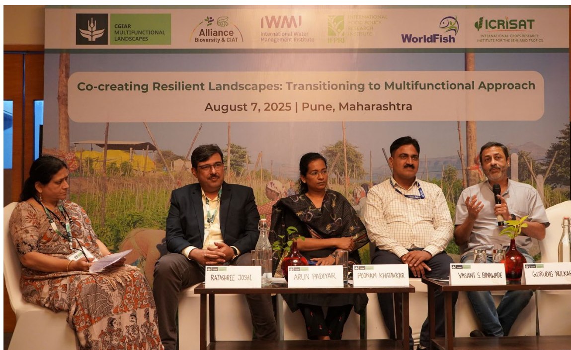
Figure 3. Experts speaking at panel discussion on Multifunctional Landscapes and Rural Development.