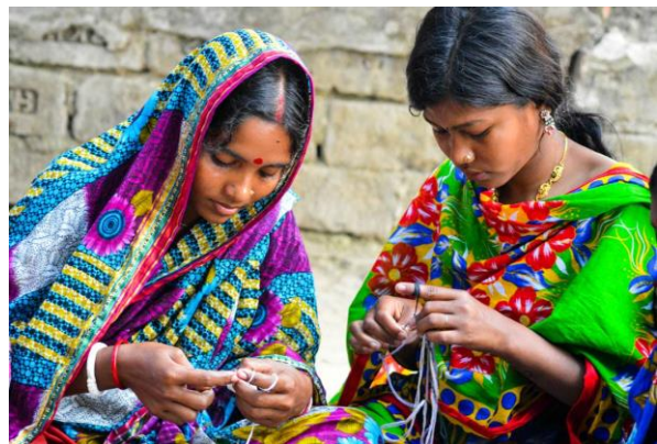
Figure 06. Small scale business run by fisher women