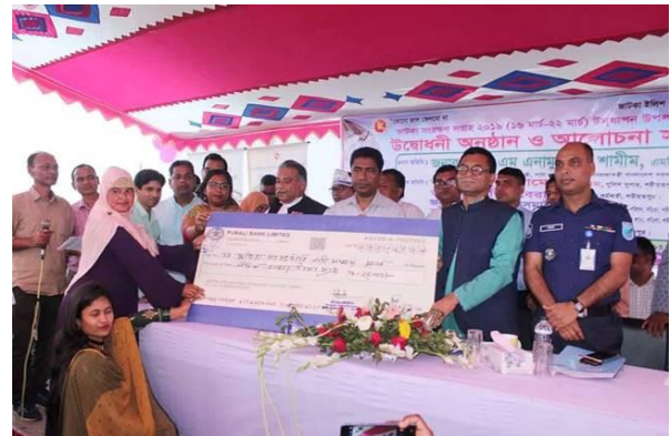
Figure 05. Monthly meeting of community savings group and matching fund distribution