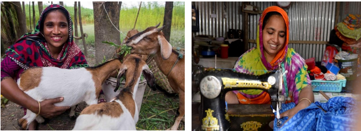
Figure 02. Women are now contributing to family income through alternative income generating activities.

Women's economic empowerment also contributed to their increased engagement in fisheries compliance and enforcement. After women's empowerment increased, fishers' illegal activities have reduced, resulting in 90 percent compliance across all 136 villages. Some villages eliminated illegal fishing activities completely. Women are also keeping their husbands engaged in family activities like gardening, livestock rearing, and pond management during fishing ban periods.