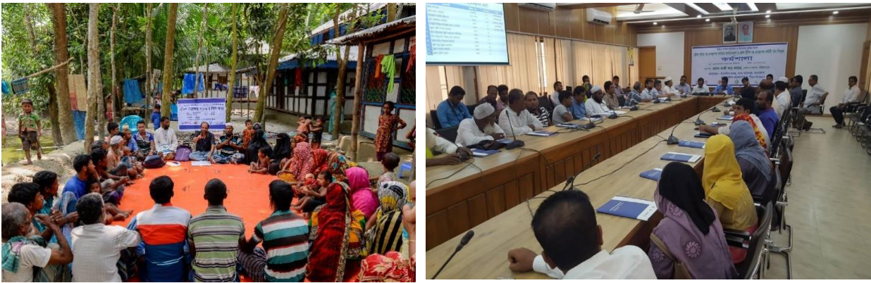
Figure 03. Women participating in Hilsa Conservation Group and in district co-management committee meeting

After two years of activities focused on women’s economic empowerment interventions, women’s mobility increased significantly and their voices were heard. Women started feeling less constrained by social norms on dress and style, and they felt confident that they could contribute to their family as well as to the community. They started convincing their male counterparts not to illegally fish during the jatka and brood hilsa fishing ban periods and not to use illegal fishing gear during other times of the year.